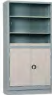
2-Door Closet with Shelf